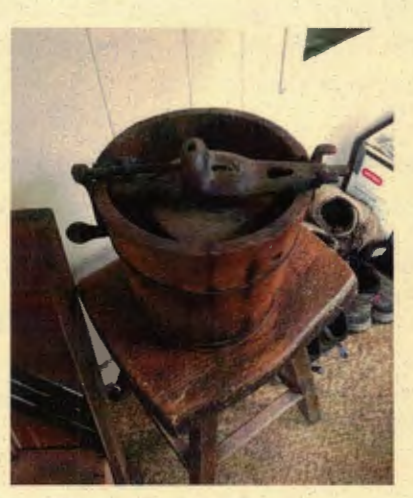
Ice Cream Churn

We continue to work on cleaning and organizing the Museum along with totally revamping the Wood Shed displays. Both these projects will give great enthusiasm to our park.