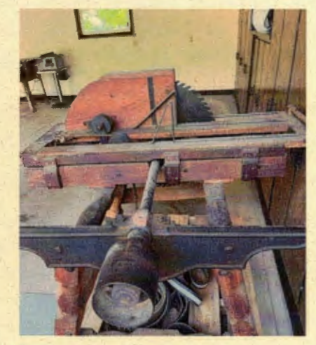
Tractor Driven Saw