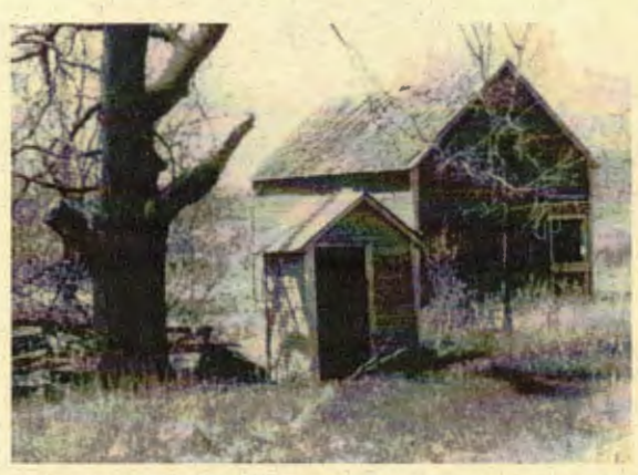
Farm operations very rarely stood still. As time and money allowed, more out buildings were constructed for special uses. One of those was the pig barn. Pigs were another important part of the farm. They provided another source of income when sold. The pig barn no longer stands, but the concrete foundation is still visible. It was a two-story wood frame building. The lower level housed the pigs, and the upper level was used for storage.

The area west and south of the barn was used as a pasture for the cows. The creek provided water and some trees provided shade, making it comfortable for the cows. If the grass got too tall in the orchard, the cows would be moved to that area to eat the grass. Inside the barn today, there is a workshop and a museum.