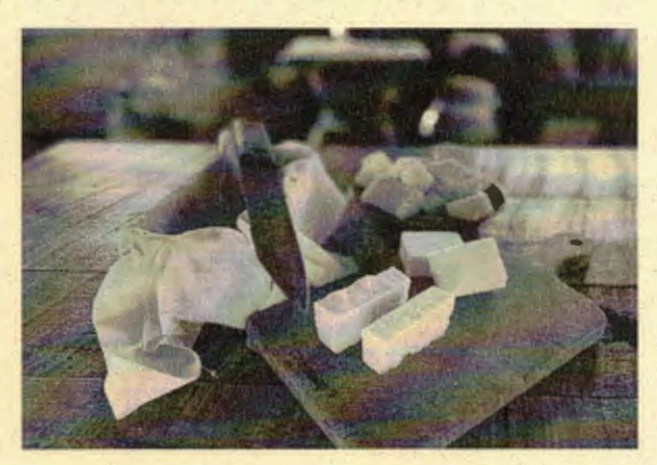
Pioneer Homestead Bar

INGREDIENTS 600 grams lard 80 grams lye (sodium hydroxide) 228 grams distilled water