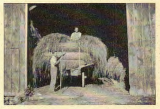
in the barn in 1918.

The barn located just west of the house is of the post and beam type construction. The lower level is constructed of fieldstone held in place by lime mortar. The walls are two feet thick and smooth on both sides. The heavy walls were necessary to carry the weight of the barn frame and large amounts of hay, grain and machinery stored on the